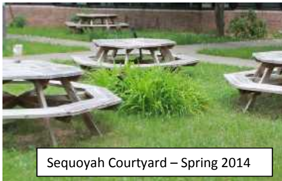
Sequoyah Courtyard – Spring 2014

Involve Sequoyah parents, Sequoyah students, Sequoyah staff/teachers, Sequoyah Building Services staff, Sequoyah administration and community members representing Montgomery County Rainscapes program, Boy Scouts, Girl Scouts, Master Gardeners, supporting businesses and Sequoyah alumni to improve the courtyard located at Sequoyah Elementary School in order to incorporate the space as an educational opportunity for hands-on implementation of Curriculum 2.0 and a relaxing space for staff and students to utilize a safe and secure outdoor classroom. The methods will be determined by a Garden committee, made up of representatives of the above-mentioned organizations, but ideally would include raised bed planting space for each grade-level, a pond and a butterfly garden, with incorporation of a brickyard landscape in conjunction with a brick fundraiser. Determination of a Spring 2015 dedication ceremony date to celebrate the 25 th year of Sequoyah Elementary School with a "garden party" will need to be set, where members of the community, elected officials, garden committee, etc. will be invited. A plan for a maintenance schedule will need to be determined to keep the garden in lasting condition for the future classes at Sequoyah Elementary School in the next 25 years.