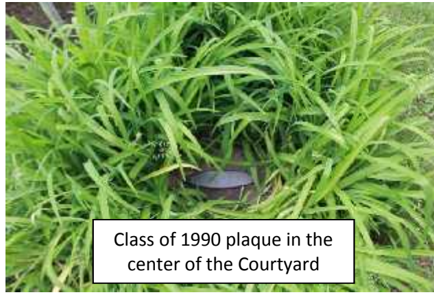
Class of 1990 plaque in the center of the Courtyard