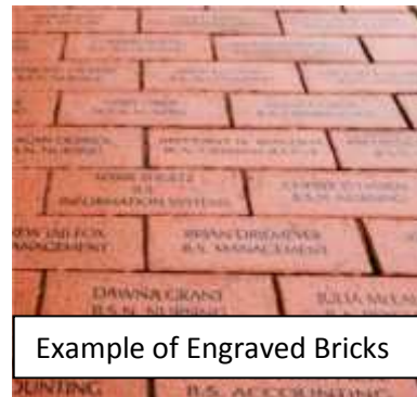
Example of Engraved Bricks