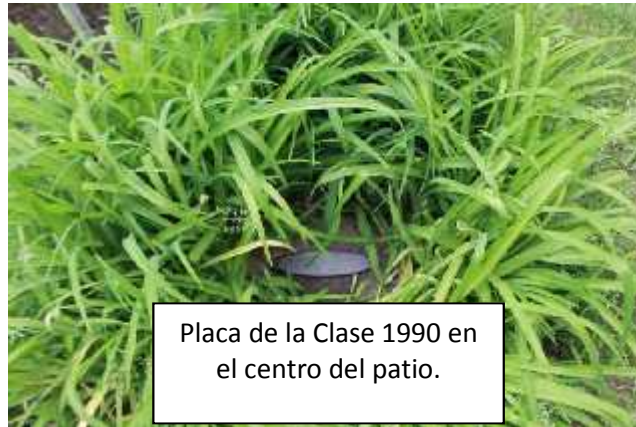
Placa de la Clase 1990 en el centro del patio.