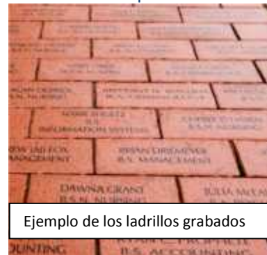
Ejemplo de los ladrillos grabados