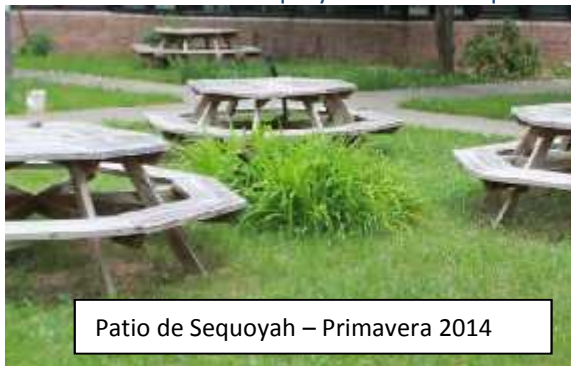
Patio de Sequoyah – Primavera 2014

Involucrar a los padres de Sequoyah, estudiantes, personal de Sequoyah, profesores, personal de mantenimiento, administración y miembros de la comunidad que representan el programa Montgomery County Rain capes, Boy Scouts, Girl Scouts, Jardineros, empresas de apoyo y ex alumnos de Sequoyah para mejorar el patio situado en la Escuela Primaria de Sequoyah con el fin de incorporar el espacio como una oportunidad educativa para las manos-en la aplicación del Plan de Estudios 2.0 así como también un espacio de relajación para el personal y los estudiantes a utilizar un lugar seguro y protegido al aire libre. Los métodos serán determinados por el comité de jardinería, compuesto por representantes de las organizaciones antes mencionadas, pero lo ideal sería incluir el espacio planteado, cama de siembra para cada nivel de grado, un estanque y un jardín de mariposas en relieve, con la incorporación de un paisaje en conjunto con una recaudación de fondos de ladrillo. La determinación de una fecha de ceremonia de dedicación tendrá que ser establecida en Primavera 2015 para celebrar el 25 aniversario de la Escuela Primaria Sequoyah con una "fiesta del jardín", donde se invitará a los miembros de la comunidad, funcionarios electos, el comité de jardín, etc. El mantenimiento del programa tendrá que ser determinado para mantener el jardín en buenas condiciones para las futuras clases en la Escuela Primaria de Sequoyah con el fin que sea duradero en los próximos 25 años.