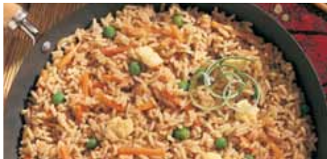
7763 Vegetable Fried Rice ▲ 📺 📱 📺 Authentic taste featuring carrots, peas, onions and eggs. With garlic sauce. 2-1 lb. rice/2-2 oz. sauce/$9.99 $9.49