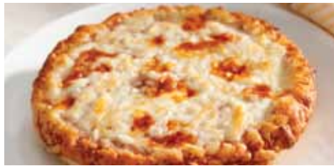
3455 Cheese Pizza Eat-zzas™ 📺 📱 📺 Individual deep-dish pizzas with a unique flaky style crust. Oven or microwave. 6-5 inch/$9.39 $8.89