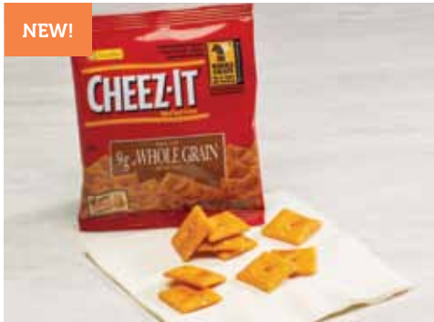
NEW! 3461 Cheez-It® Snack Packs ▲ 📺 📱 📺 Cheez-It® Baked Crackers with 9g of whole grain per 100 Calorie Pack. Made with 100% real cheese. Guilt free snack, easy to grab & go! 25-.75 oz bags/$9.59