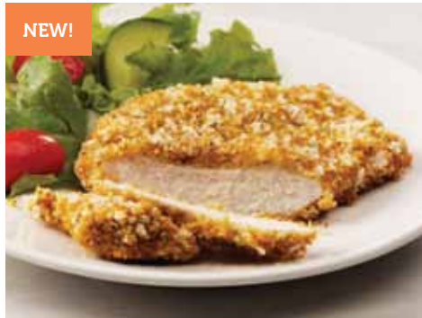
NEW! 1682 Dijon Encrusted Pork Chops ▲ Boneless Dijon chops. Crunchy outside-moist and juicy inside. A Taste For Health item, not in stores. Bakes in less than 25 minutes. 4-5 oz./$13.49