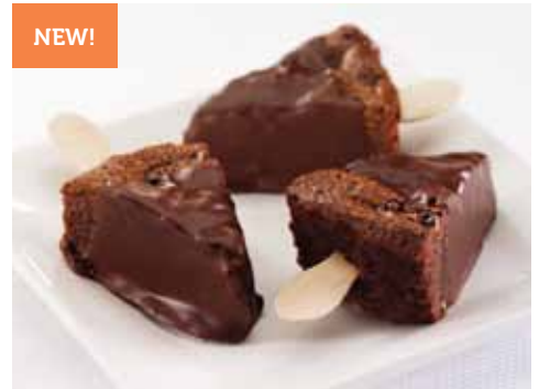
NEW! 4795 Fudge Dipped Brownie Pops 📺 Decadent fudge-dipped chocolate brownie on a stick. A 250 calorie delicious dessert or indulgent snack. Individually wrapped. 8-2 oz/$9.79