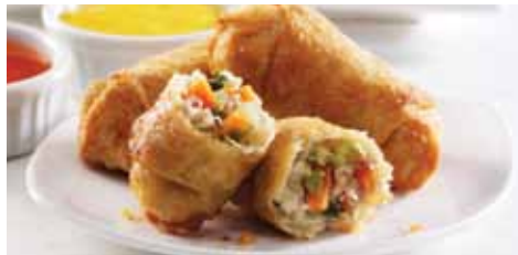
4048 Egg Rolls with Sauce 📺 📱 ★★★★★ Hand rolled with pork & veggies. Includes sauce. 24-1.5 oz. egg rolls/3 sauce packets/$15.49 $14.49