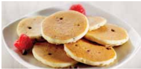
5160 Chocolate Chip Mini Pancakes ▲ 📺 📱 📺 Chocolate chips in fluffy pancakes. Low fat. 71¢ per serving 2-48 packs/1.65 lbs./$12.29 $11.29